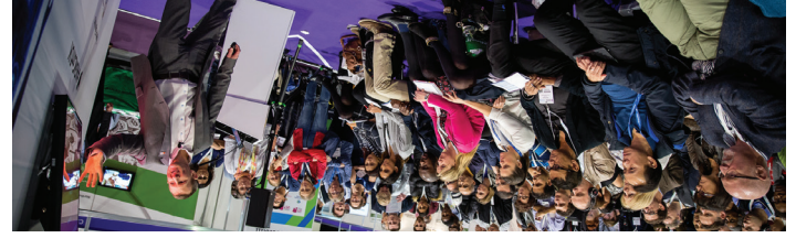
Conference programme correct at time of printing